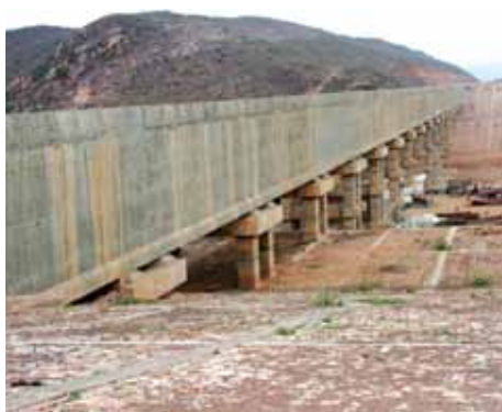
Aqueduct at Km 7.125 of Bansagar Feeder Channel, Madhya Pradesh