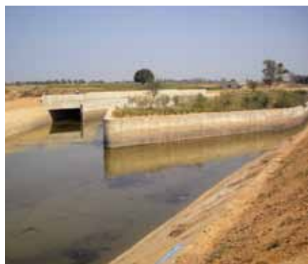
Aqueduct at Km 2.260 of Belan Main Canal, Barondha, U.P.