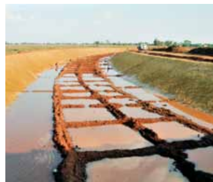
Mandhar Branch Canal, Abhanpur, Chhattisgarh